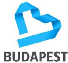
Illustration 15: You would not think how much input is behind a logo or its creation. In the blue ribbon logo of Budapest there is a reference to Danube and the bridges (each fold in the ribbon is a bridge). The logo also embodies a rotated letter B, and a rotated heart. The blue ribbon carries a positive message in itself as it usually symbolizes the first place in watersports/sailing races.

Illustration 14: The former logo of Budapest with a blue ribbon is a good example of a basic version that can be animated in films and digital materials.