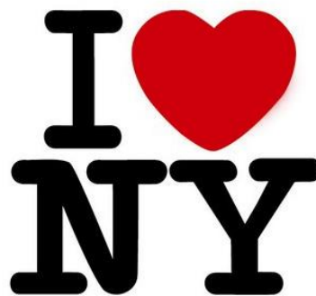
Illustration 6: The famous "I heart NY" logo was designed by Milton Glaser of Push Pin Studios. The name of the famous designer played a significant role in the first years of the visual symbol, therefore it was not replaced.

Let us have a further look at cities and villages, this time with examples from Hungary.