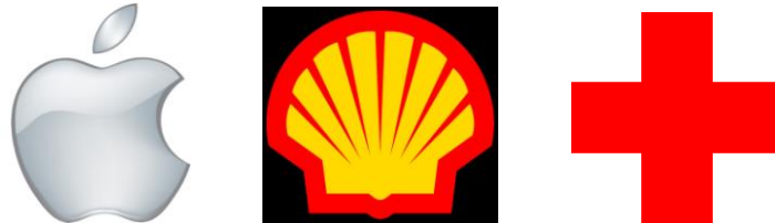
Illustration 1: The original meaning of the term logo is "word" – Apple, Shell, or the Red Cross could exclude their brand names because their logos are brand names as well – in English-speaking countries people say apple, shell, and red cross if they see the sign of an apple, a shell, or a red cross

– Is the logo simple? Are you sure it does not include too many elements? (It is no coincidence that if we consider the logo history of great brands, they have become simpler.)