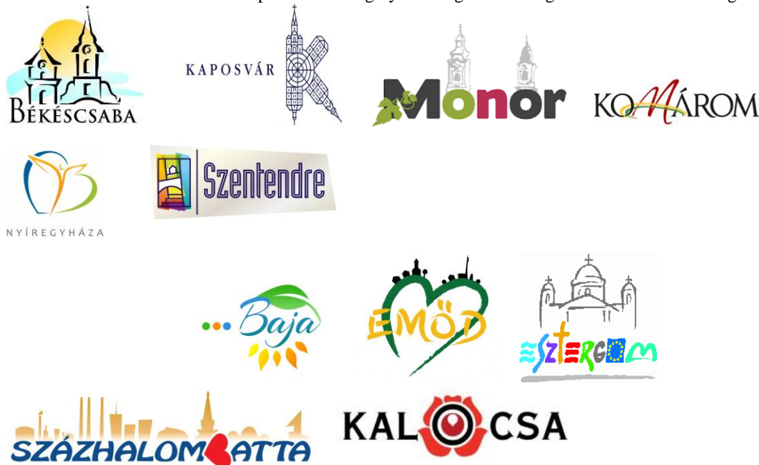
Illustration 10: A few examples from Hungary with logos including the name without a slogan

It is important to point out that the inclusion of the slogan in the logo is not always compulsory. On the one hand, if a city can not find a unique slogan characterizing the place, it is not worth pushing the issue. On the other hand, it is possible that a specific logo should be used alongside with a slogan (or slogans) in certain cases, while it should be used with no slogan for other purposes.