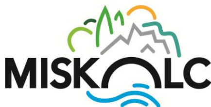
Illustration 17: The figure below suggests that Miskolc has used a wide range of logos so far – luckily they used one for 10 years, and have been using the current one for 5 years.

Illustration 16: The new logo of Miskolc was introduced in 2012, and sparked a heated debate – the logo includes local sights such as the Diósgyőri Castle, Lillafüred and the Cave Bath of Miskolctapolca.