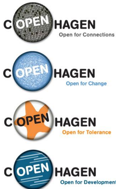
Illustration 13: In the case of Copenhagen the term 'open' appears in various forms, always adapted to the intellectual content of the specific slogan, for example: 'open for connections', 'open for change', 'open for tolerance', and 'open for development'.

Some cities go even further in flexibility. According to Neumeier (2006, p. 91.) logos used to be important tools in the era of print press, but in the online age they are replaced by avatars that can be 3D, and may even move or jump. He claims that variations in the visual identity – and, in general, branding – may function similarly to people, who can be serious or funny at different times, but others always recognize them.