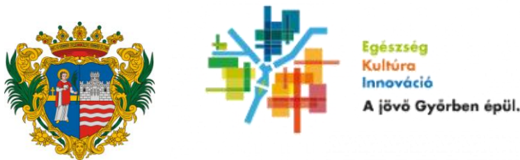
Illustration 3: The duality of the city logo and coat of arms (and, in certain cases, their multitude) is an issue in all cities: The coat of arms and former logo for Győr, Hungary (the logo was replaced in 2017)

Many cities use a coat of arms and a logo at the same time, but the situation is further complicated by the fact that several cities also use a variety of logos serving various purposes: