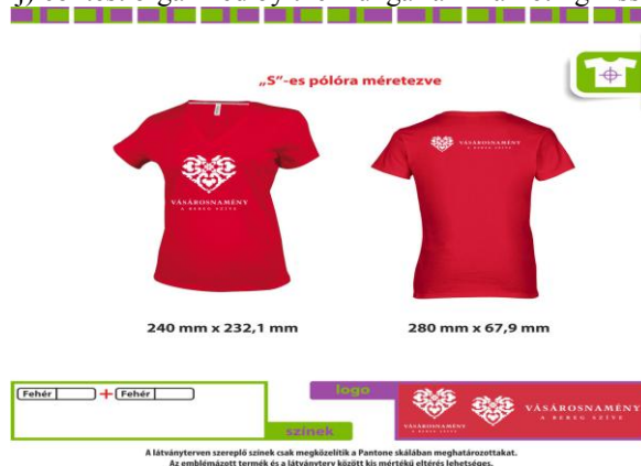
Illustration 18: Testing a (city) logo: "Would we take on a T-shirt like that?" - It is no accident that the city of Vásárosnamény included this plan in its city identity manual, winning the National City Marketing Prize (Országos Városmarketing Díj) contest organized by the Hungarian Marketing Association